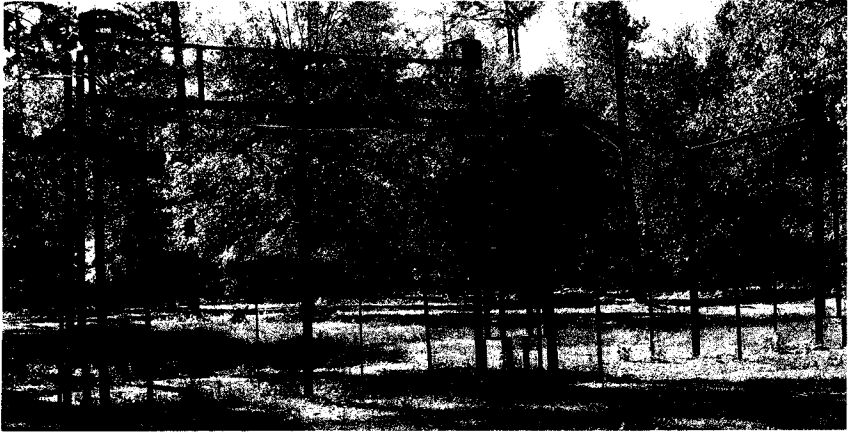
FIG. 1. Models #3 (left) and #1 (right) of a permanent flight trap for migrating butterflies.

terflies were to encounter the central barrier, be detained between the roof and the barrier, and work their way upward to the nearest end. There they were to continue upward through an 8 \times 24 cm opening, through an immovable hardware cloth "valve," and into a holding cage of plywood and \frac{1}{4} inch hardware cloth. Watching migrants encounter model #1, I discovered that most individuals shunned the offered openings and instead flew out and over the roof or around the end "wall" (i.e., panels of \frac{1}{2} inch hardware cloth that extended 1.2 m from either end of the central barrier and perpendicular to it).