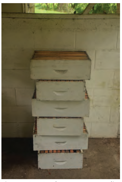
Figure 12 – Stack supers perpendicular to one another when removing them from the hive. This helps minimize the number of bees that will be crushed when inspecting a hive. [Note: These supers are stacked for storage, but they illustrate how one would stack supers if removing more than one from the hive being inspected.]

11) Remove the frame in the second position, inspect it for the queen, and place it outside the hive. I mentally number my frames 1 – 10, with the frame nearest me being #1 and the frame furthest from me being #10. Many beekeepers like to remove frame #1, the outermost frame (the one nearest you if you stand to one side of the hive) of the brood chamber first. I prefer to remove frame #2 (the second frame from you) first. I like to do this for a few reasons. First, frame #1, being on the side of the hive, often contains mostly pollen and/or honey. That is where the bees prefer to store these foodstuffs and that is where I