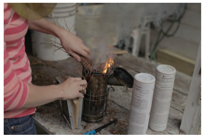
(I) Figure 7 – Ratchet straps are good to have when you need to move a hive. (r) Figure 8 – Light a smoker before going into a hive. It can take a little time to learn to light a smoker correctly. You do not want the smoker to go out while you are inspecting the hive. It is important to light a smoker in a location that does not contain flammable material or that cannot itself catch on fire.

many people are today. However, I think there is great value in carrying a cell phone to the apiary with you. First, you will have a phone with you in the event that you need help. Did you see a snake? Do you need someone to come get your vehicle unstuck? Is one colony robbing another one and you need someone to bring you the equipment needed to stop it? I also like to have a cell phone on hand, particularly a smart phone, so that you can take pictures of anything you see that needs further explanation. I routinely get emails and calls about hives that I never see expressing signs of disease that I cannot verify. Usually, a beekeeper wants me to diagnose a problem in his/her hives that may be hundreds or thousands of miles away from Florida. I frequently ask the beekeeper if he/she can take a picture or a video of what they see and send it to me. I think that cell phones are a useful tool in that regard.