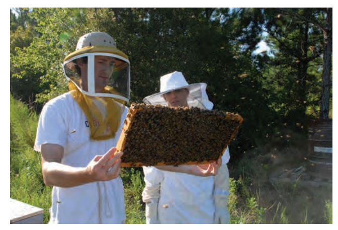
(I) Figure 13 – Remove the queen excluder from the hive. Check both sides for the queen. (r) Figure 14 – Remove and inspect each frame.

typically like to leave that frame. The first frame you remove from the hive typically is the one you leave out of the hive the entire time you are inspecting it. I prefer for it to be a frame that can be returned most anywhere in the hive once I am done. Frame #2 is more likely to contain brood, so I am able to return it to positions 2-9 in the nest and not upset the organization of the nest too much. Second, I find that the outermost frames (Frames 1 and 10) often are the most difficult to remove without damaging bees. I seem to do less damage to bees when removing frame #2 than I do when removing Frame #1.