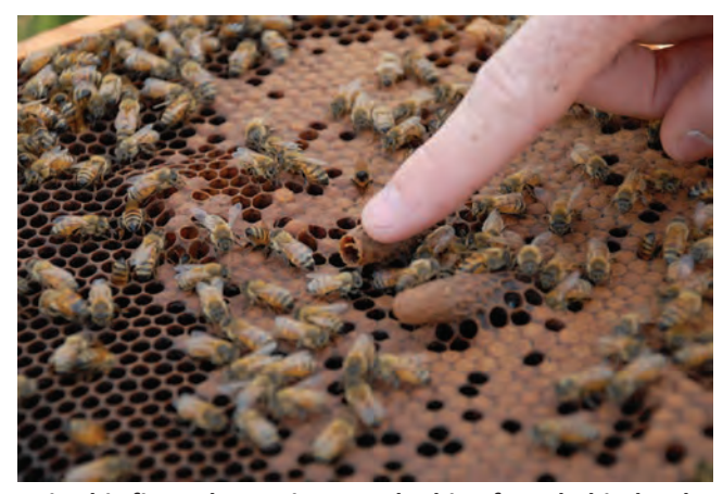
Figure 15 – Return inspected frames to the nest. The beekeeper in this figure has to inspect the hive from behind as he cannot stand beside the hive given its arrangement on the stand. (r) Figure 16 – Some beekeepers remove queen cells from a hive in an attempt to reduce the colony's swarming tendency. I am pointing at a cell opened at its end, suggesting that a queen has emerged normally.

17) Lightly smoke and replace first super. Gently replace the super. I like to do this in a slow rocking motion as I lower the super. I find that this often moves bees out of the way as I lower the super.