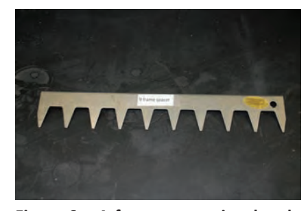
Figure 6 – A frame spacer is a handy device to have if you use fewer than ten frames in a hive.

<u>12) a cell phone</u> – I am not crazy about being connected to technology the way that