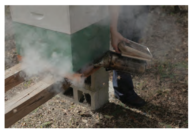
(I) Figure 9 – Do you see normal flight activity when inspecting the hive's entrance? (r) Figure 10 – Lightly smoke the entrance of the hive prior to inspecting it.