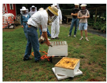
Figure 11 – Place the super on the hive lid. It is best to position the super perpendicular to the lid, or at least catty-corner to the lid as shown in this figure.

11) Remove the frame in the second position, inspect it for the queen, and place it outside the hive. I mentally number my frames 1 – 10, with the frame nearest me being #1 and the frame furthest from me being #10. Many beekeepers like to remove frame #1, the outermost frame (the one nearest you if you stand to one side of the hive) of the brood chamber first. I prefer to remove frame #2 (the second frame from you) first. I like to do this for a few reasons. First, frame #1, being on the side of the hive, often contains mostly pollen and/or honey. That is where the bees prefer to store these foodstuffs and that is where I