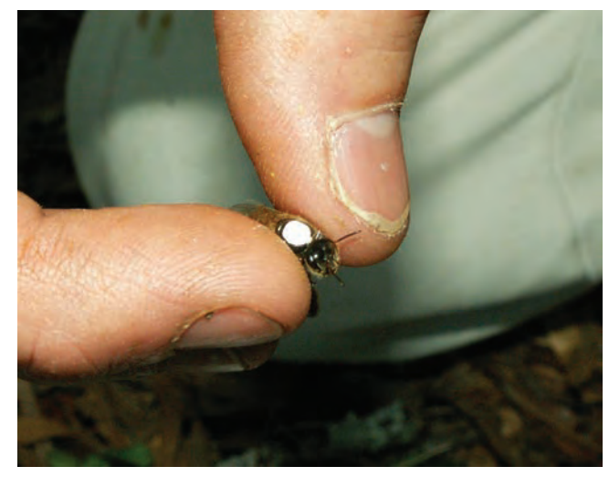
(I) Figure 3 – Clipping one of a queen's forewings using a small pair of scissors. I am holding the head and thorax of the queen in one hand, while clipping one forewing with the other. (r) Figure 4 – A queen marked using the head of a small nail as a paintbrush.

while prying it with the hive tool, or the bottom bar would get stuck in the hive as I remove the rest of the frame. When this happens, it is great to have a small tack hammer and nails on hand so that one can repair any frames in real time.