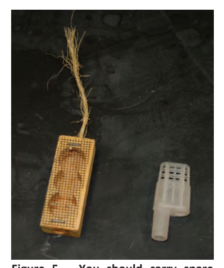
Figure 5 – You should carry spare queen cages with you when inspecting hives. You never know when you are going to need to cage a queen.

5) frame repair pieces – Similar to having a tack hammer and nails on hand, it is also nice to have some of the top bar repair pieces with you when inspecting a hive. This is a little known gadget that most beekeepers have never seen/used. As you know, all frame top bars have a small piece that extends beyond the frame end bars. These pieces, or frame "lugs," are the part of the frame on which the frame rests in the grove cut into the ends of the super. These lugs often break off with repeated use, due to natural wear and tear and the general weight of heavy frames. Some manufacturers make small metal repair pieces for this