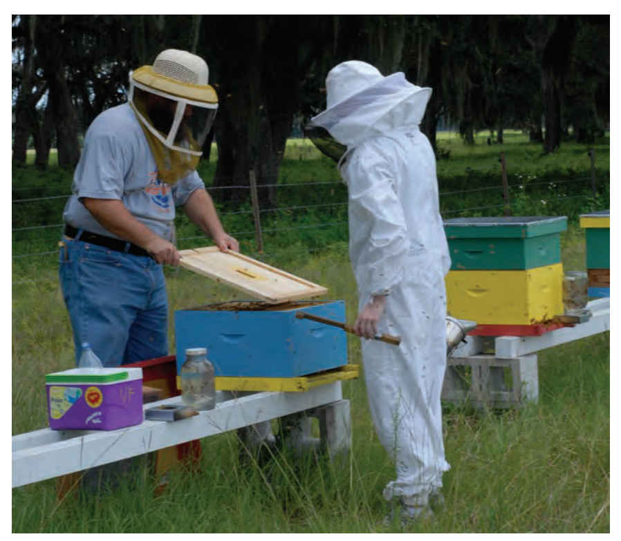
Figure 1 – Two beekeepers wearing different amounts of personal protective equipment (PPE). The beekeeper on the left is only wearing a veil while the one on the right is wearing a full suit. You should wear the amount of PPE that you are comfortable wearing. I recommend always wearing at least a veil.

to start fires where fires are not otherwise wanted. It is preferable to put the smoker out after use anyway. However, some beekeepers put lit smokers in the back of their trucks. This is a perfect example of when to use a smoker box. I happen to use a small metal pail for this purpose.