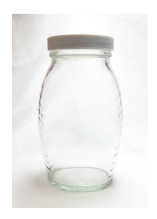
Queenline Style Jar