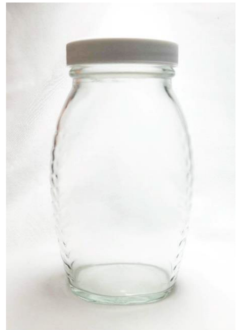
Queenline Style Jar