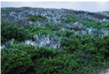
Coastal uplands. Top: beach dune. Bottom: coastal strand.

Coastal Uplands. Along most of Florida's seacoast can be found dynamic, shifting beach dune areas (top left). Inland from these are stabilized berms or coastal strand (bottom left). The more unstable areas are characterized by grasses such as sea oats, beach cordgrass, sand spur, panic grass, and seashore paspalum, and broadleaf plants such as beach morning glory, railroad vine, beach sunflower, and sea rocket. Slightly inland, shrubby plants such as sea grape, cabbage palm, evening primrose, prickly pear, Spanish bayonet, and wax myrtle also occur. Farther inland, other salt tolerant shrubs dominate, including saw palmetto, cabbage palm, yaupon, sea grape, lantana, and woody goldenrod. Plant density increases from the beach area inland. Grass-dominated areas often support a wide array, and moderate number, of grasshoppers. As is the case with most plant communities, however, as the density gets high and low-growing plants are shaded out, grasshopper abundance decreases.