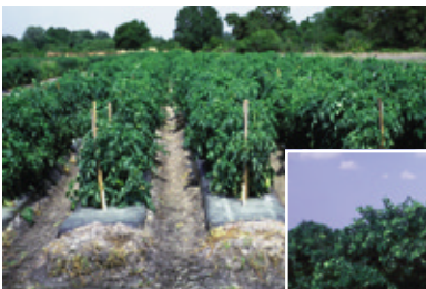
Above: tomato crop. Right: citrus grove.

Crops and Pastures. Crop and pasture habitats consist of a monoculture of introduced plants. However, both systems often have grass and broadleaf weeds interspersed among the cultivated plants. There also may be a considerable amount of bare soil present, particularly in row crops. Crop and pasture environments range from temporary to long duration. In Florida, it is often possible to grow two or even three crops annually on the same plot of ground, but perennial crops such as citrus and pasture may persist