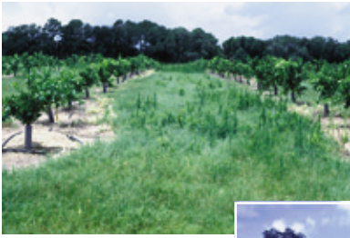
Above: citrus grove. Right: pasture.