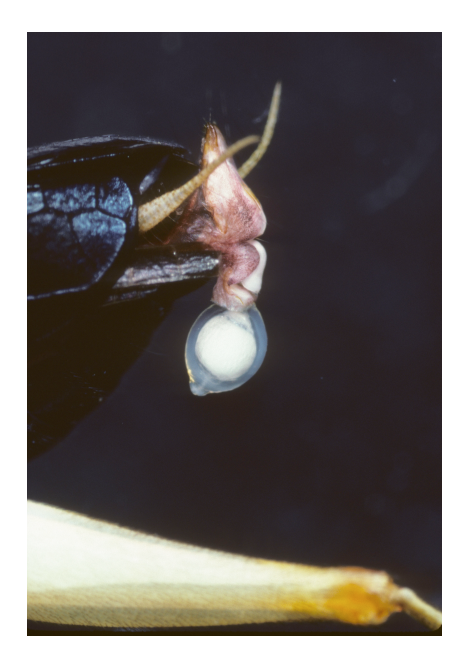
Figure 5. Extruded macrospermatophore in male's genitalia.

away) remain about one antenna-length behind the male, maintaining contact with the tip of one antenna touching the males' tergites (Fig. 4). Sometimes a female will approach the male and mouth one of his hind tibia, but males discourage this by moving away slightly. Occasionally males turn around, apparently to check the female's location. This usually occurs after the female has wandered off. Both the male and female antennate continuously and palpate the substrate. After 5 to 10 minutes of uninterrupted courtship, the male extrudes his genitalia and produces a spermatophore (Fig. 5).