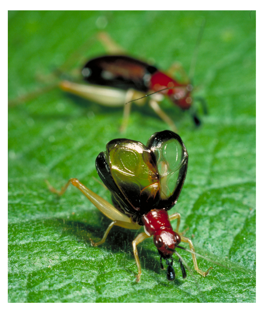
Figure 4. Male singing and female approaching from behind.

turned back-to-back and kicked at each other with their hind legs—it was not very effective as neither one dislodged the other, and the exchange lasted only a few seconds, after which they resumed courtship. In the presence of a female, males keep their tegminae raised almost continuously, but sing intermittantly. During courtship, males face directly away from their potential mate, and (especially during the early stages of courtship) tremulate frequently. Tremulation by males is accomplished by rocking the body forward and backward vigorously while maintaining a firm foothold on the substrate. Attentive females (i.e., those that do not walk