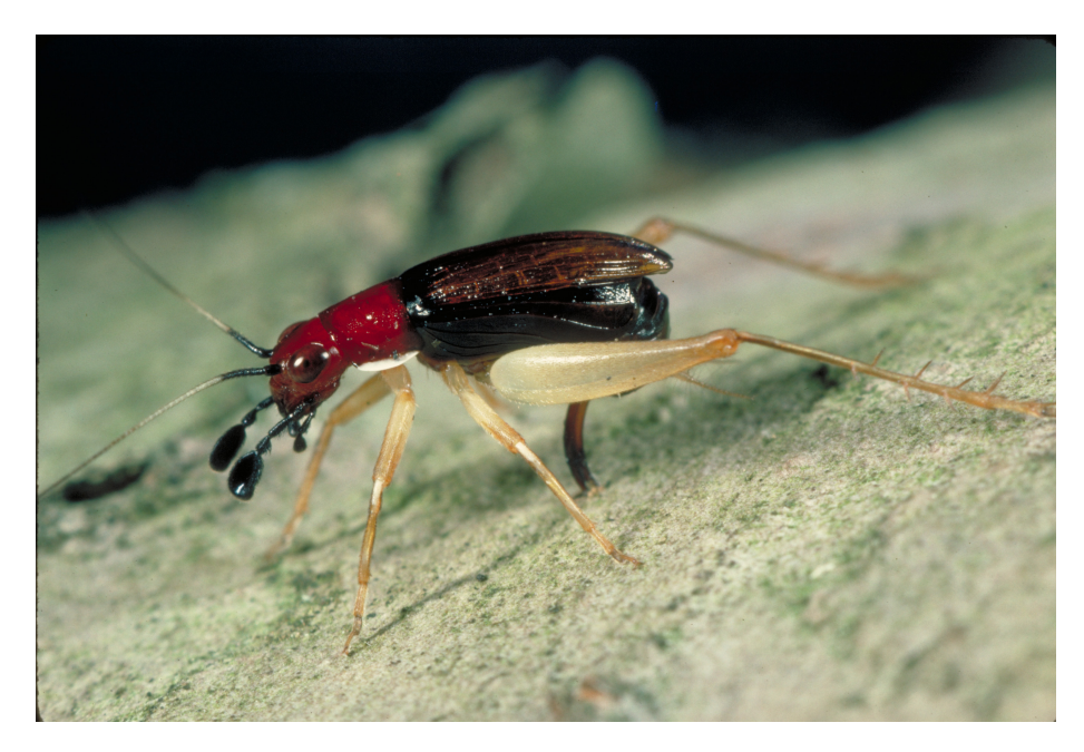
Figure 2. Female ovipositing in trunk of an apple tree.

transfer from a ventral view with a hand-held Wild M3 stereo microscope (sans base and post). For enumeration of sperm, spermatophores were collected and placed in ~100 uL saline (0.15M NaCl) where they were allowed to empty themselves, after which an equal volume of 5% buffered formalin was added as a fixative