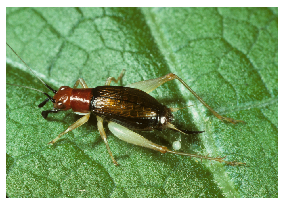
Figure 8. Female with attached macrospermatophore.

About 10 seconds to 1 minute after sucessful transfer of a microspermatophore males evert their genitalia (which are always retracted between