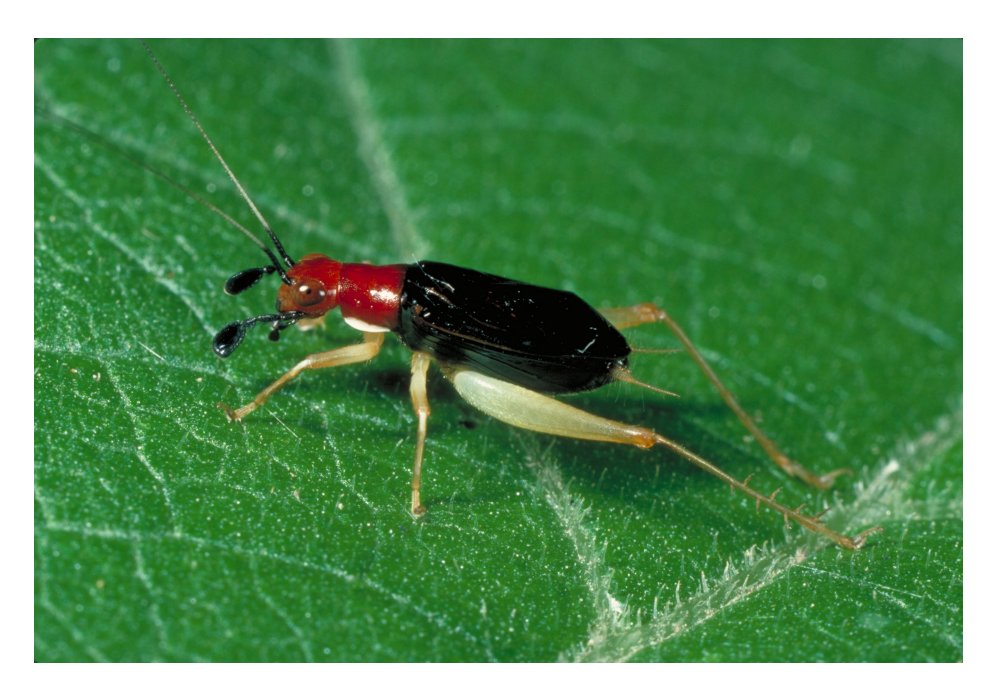
Figure 1. Male Phyllopalpus pulchellus .

Phyllopalpus pulchellus Uhler (Trigonidiinae) is a distintive cricket found throughout much of the eastern U.S.(<u>http://www.entnemdept.ufl.edu/walker/buzz/641a.htm</u>) and is common among course weeds around the margins of old fields in Chester County, Pennsylvania. There adults appear in early August and are present through September and early October. The distinctive sputtery, metallic, broken trill of calling males is easily recognized among the cricket singers in this area. Walker (1962) described this song as an "irregular and 'ragged' trill". Phyllopalpus pulchellus is strikingly colored (Fig. 1 and 2) and primarily diurnal, and yet difficult to see or collect because of its extremely rapid retreat (usually to the underside of a leaf) upon the approach of an observer. Males usually sing while concealed between leaves (Fig. 3) about 0.5-2 meters above ground level. But on cool (less than 15°C), sunny mornings in September and October in