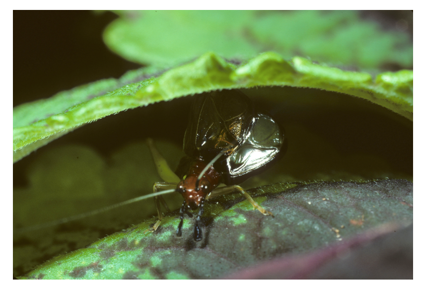
Figure 3. Male singing from between leaves

sing almost continuously and frequently tremulate (by moving their body violently in a forward to backward cyclical movement, usually consisting of two or three cycles for a given tremulation). Their behavior among other males seems to be a territorial display, but only once have I seen actual physical aggression between males; two males courting the same female briefly