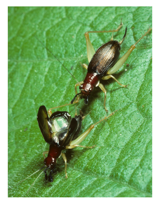
Figure 6. Male singing with attentive female moments before the male backed under her and transfered a microspermatophore.

Females then remove the microspermatophore, usually within seconds of its transfer, always within three minutes.