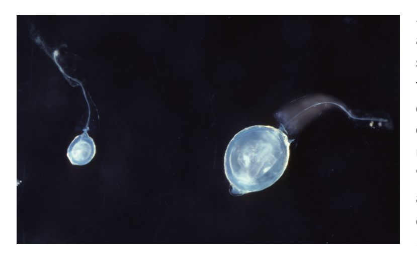
Figure 7. Microspermatophore and macrospermatophore.

Phyllopalpus females are apparently unable to reach the spermatophore directly with their mouthparts the way some other crickets (such as the oecanthines) do. Instead, they use the hind tibial spurs to "pluck" it out. This is accomplished by cradling the exposed portion of the spermatophore tube in the Vshaped notch formed by the two apical spurs of the hind