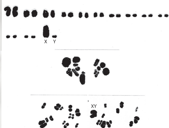
FIGURE 12. N. ambagiosa male and female habitus, calling song, male and female terminalia, and karyotype.

karyotype PARATOPOTYPE CA: Lake Co. S14-64 T14-24 JAC000001949