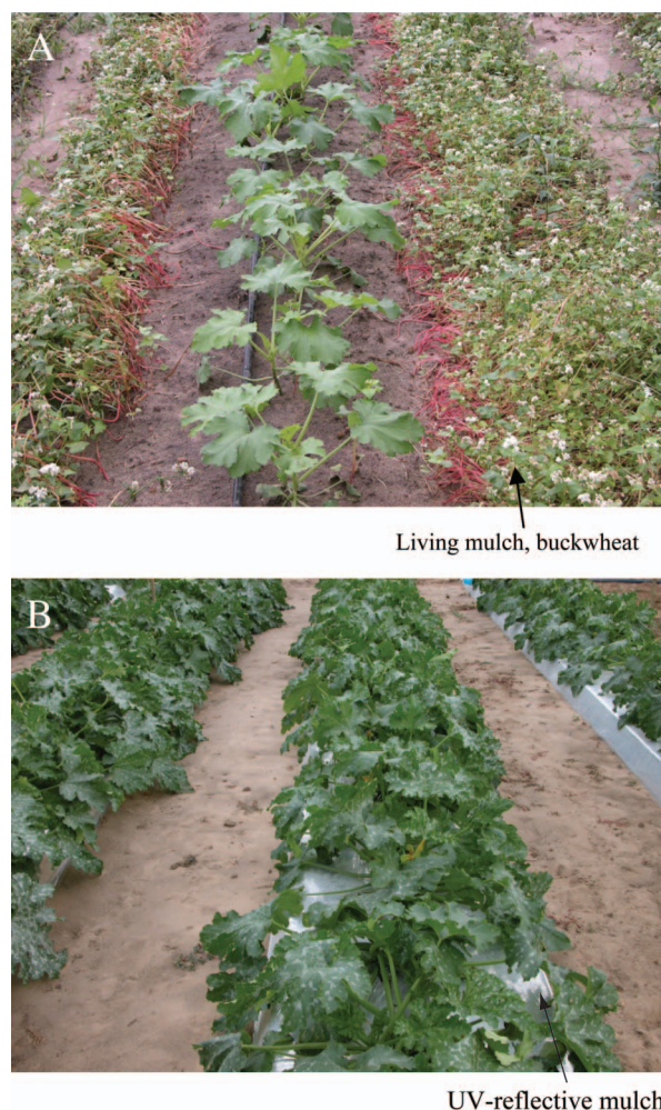
Figure 1. (A) Zucchini squash growing with living mulch. (B) Zucchini squash growing on UV-reflective mulch.

Nine plants were randomly selected from each plot for visual observations. Alate and apterous aphids (adults