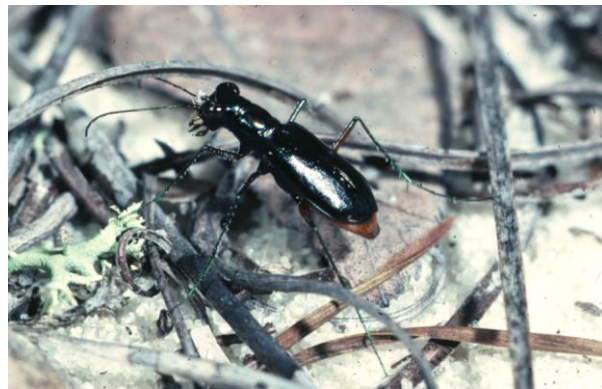
Cicindela highlandensis Choate